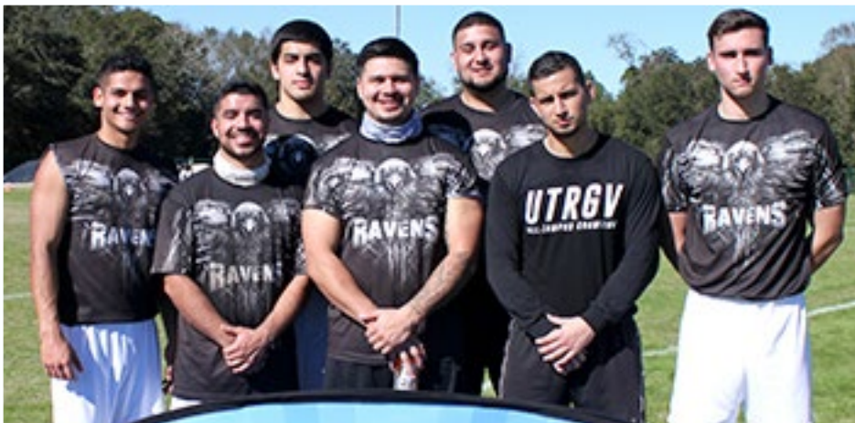
University of Texas Rio Grande Valley Men's National Champion