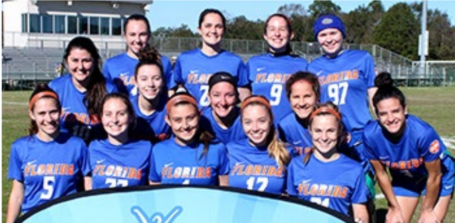
University of Florida Women's National Champion