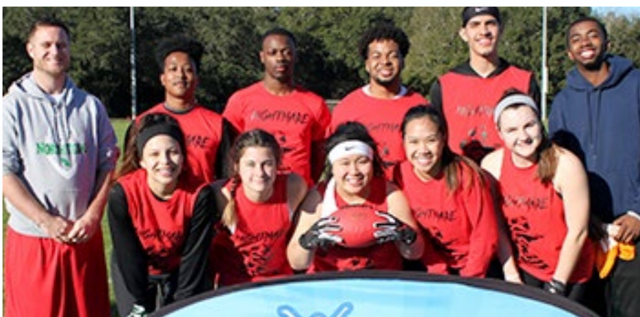
University of North Texas Co-Rec Champion